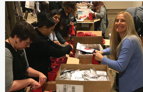
Employees creating care packages for the men and women serving overseas at the 2019 Connexus Convention.

Care packages were sent to soldiers in partnership with Operation Gratitude