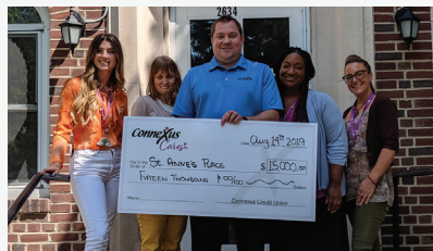
St. Anne's Place emergency shelter in Minneapolis, MN.