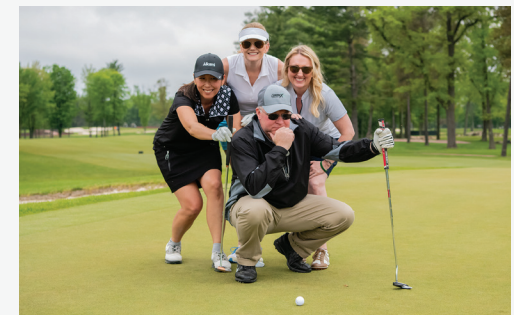
2019 Connexus Invitational at SentryWorld Golf Course in Stevens Point, WI.

Raised for Relay for Life during the annual Connexus Invitational