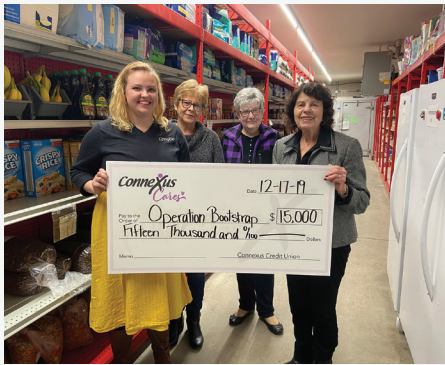
Operation Bootstrap is the principle food bank for Portage County, WI.

Food donations to non-profits is a core purpose of Connexus Cares.