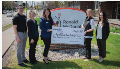
Ronald McDonald House in Marshfield, WI.