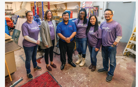
Connexus volunteers at the Hmong American Center in Wausau, WI.

Of employees utilized some or all of their VTO hours