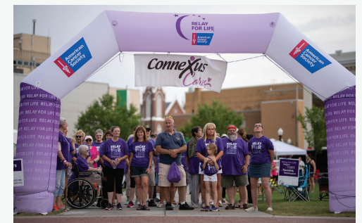
2019 American Cancer Society Relay for Life in Wausau, WI.