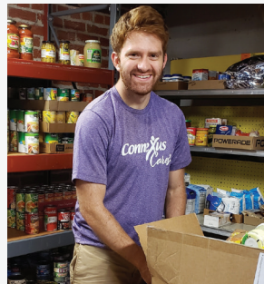
Connexus employee volunteering at a food pantry.