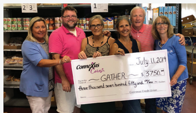
Gather food pantry in Portsmouth, NH.

Connexus is proud to be the sole presenting sponsor for the American Cancer Society Relay for Life in Wausau, WI.